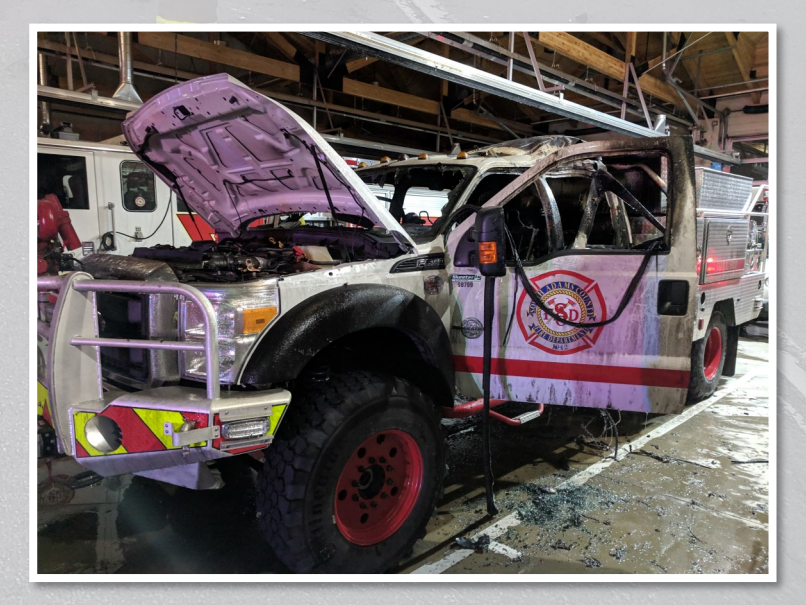
April 11th fire at SACFR Fire Station