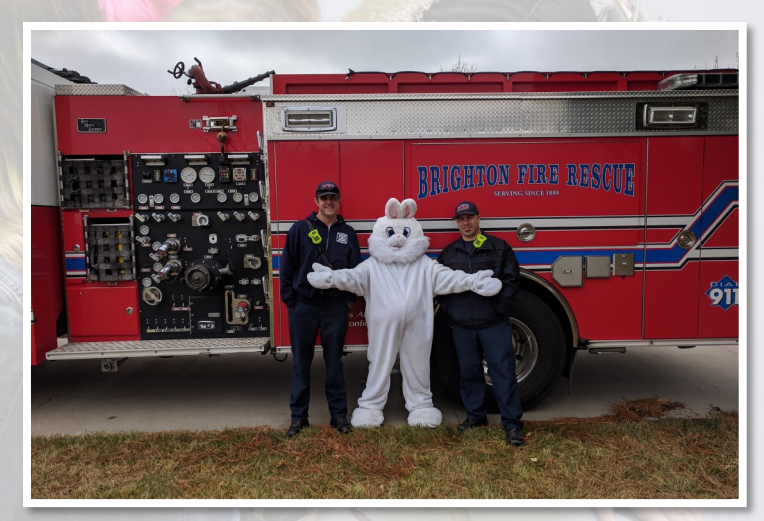
Crews did truck displays at Egg Dash and Springfest on April 13th