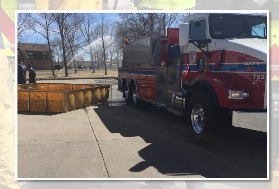
Wildland Fire Training at the Training Center