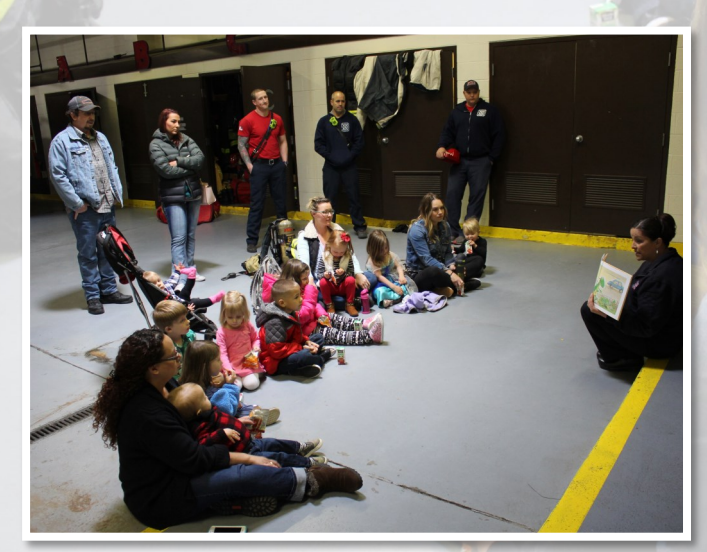
In April Station 51 hosted Story Time

Public Interactions 21 Residents Contacted 526