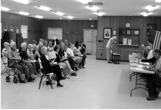
Lake residents at July 14, 2015 meeting

P.O. Box 447 Manchester, MI. 48158 www.twp-freedom.org/plpoa - Newsletter-Summer 2015