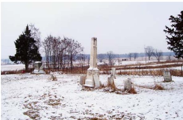
View of Waters Road Cemetery

If you plan to attend, an RSVP to one of the people above will also help us with a headcount for the lunch. We look forward to seeing you there!