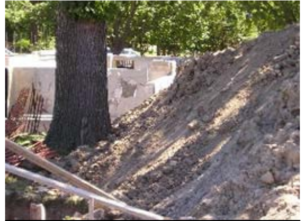
Soil compaction results from storing materials under a tree

Many of these practices are in the City's tree preservation ordinance. Familiarizing yourself with this ordinance is a good way to understand your legal rights. Notify the Forestry Department of any violations in order to correct them and prevent problems in the future.