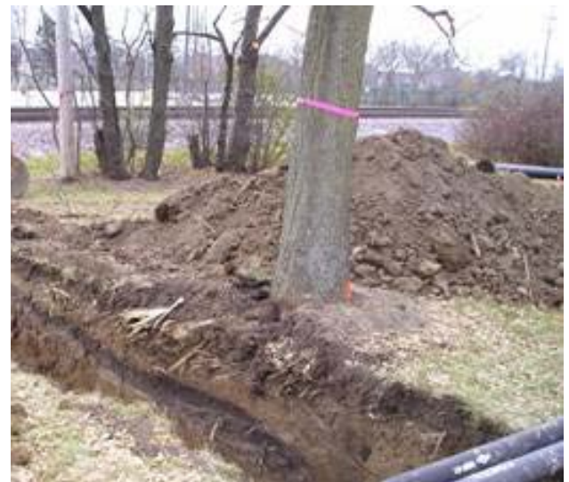
Fatal root damage due to trenching within root zone