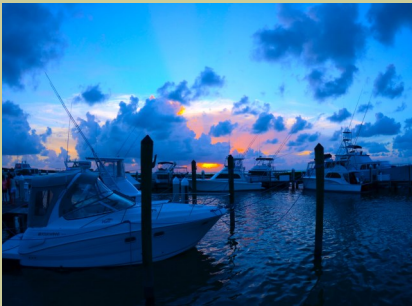
Sunset on the Docks

Located in Founders Park, Islamorada the “Sport Fishing Capital of the World” has 83 slips and is half way between Miami and Key West airports. With a public beach, an Olympic size swimming pool, tennis courts, a dog park, nature walk and work-out area, the sheltered harbor has bath and laundry facilities, and pump-out stations for each of the slips.