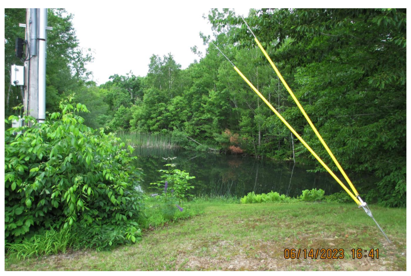
Pond 300 feet in front of the house across driveway.