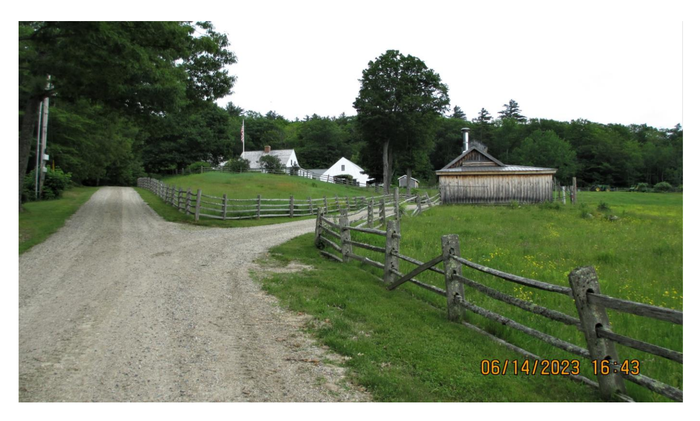
Point about 300 feet from corner of house.