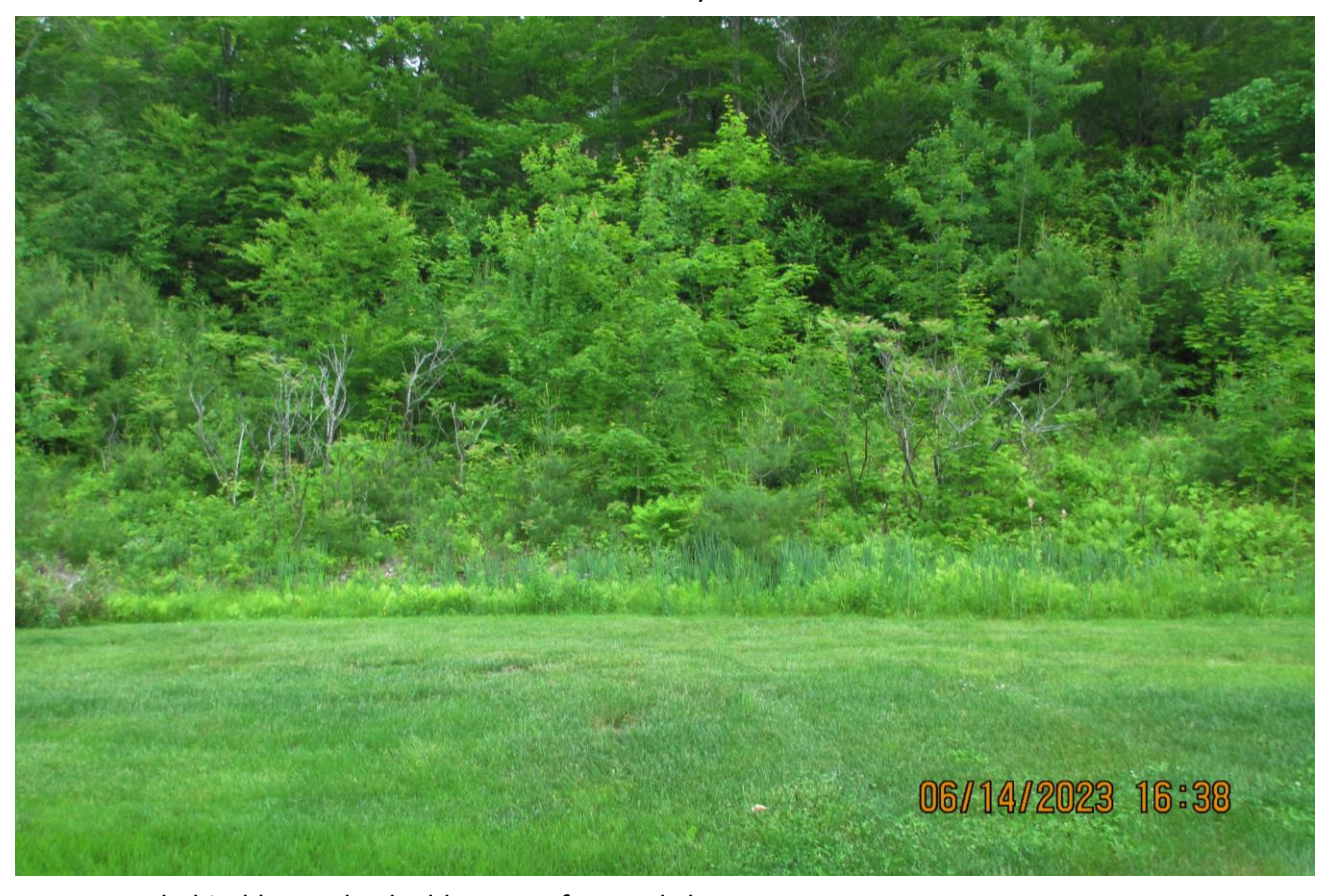
Wet area behind house backed by steep forested slope.