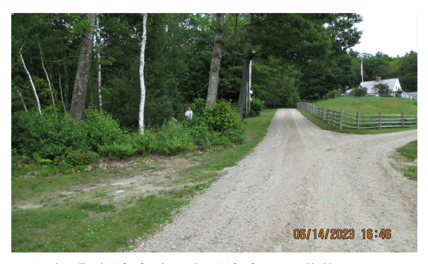
Ms. Cove by wellhead 300 feet from house; about 220 feet from proposed building