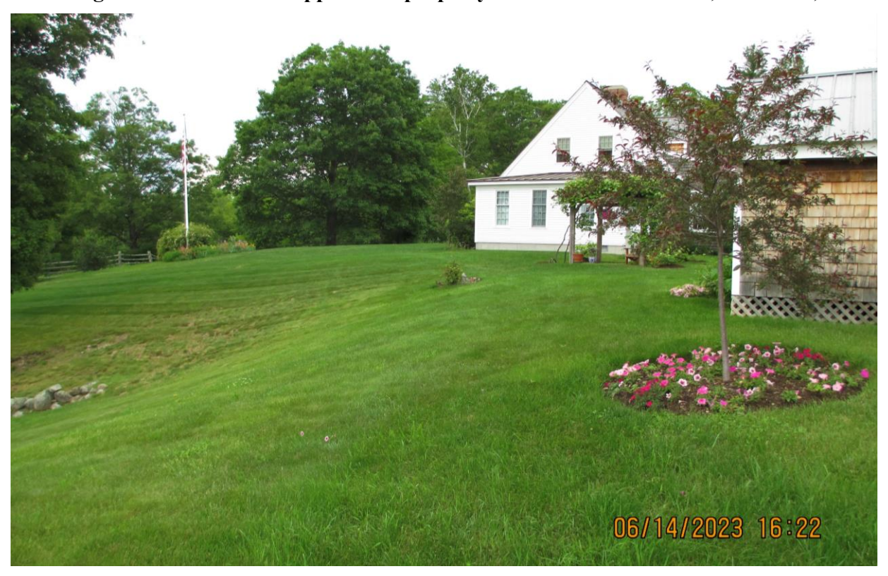
East side of house. Left lawn is existing septic system.