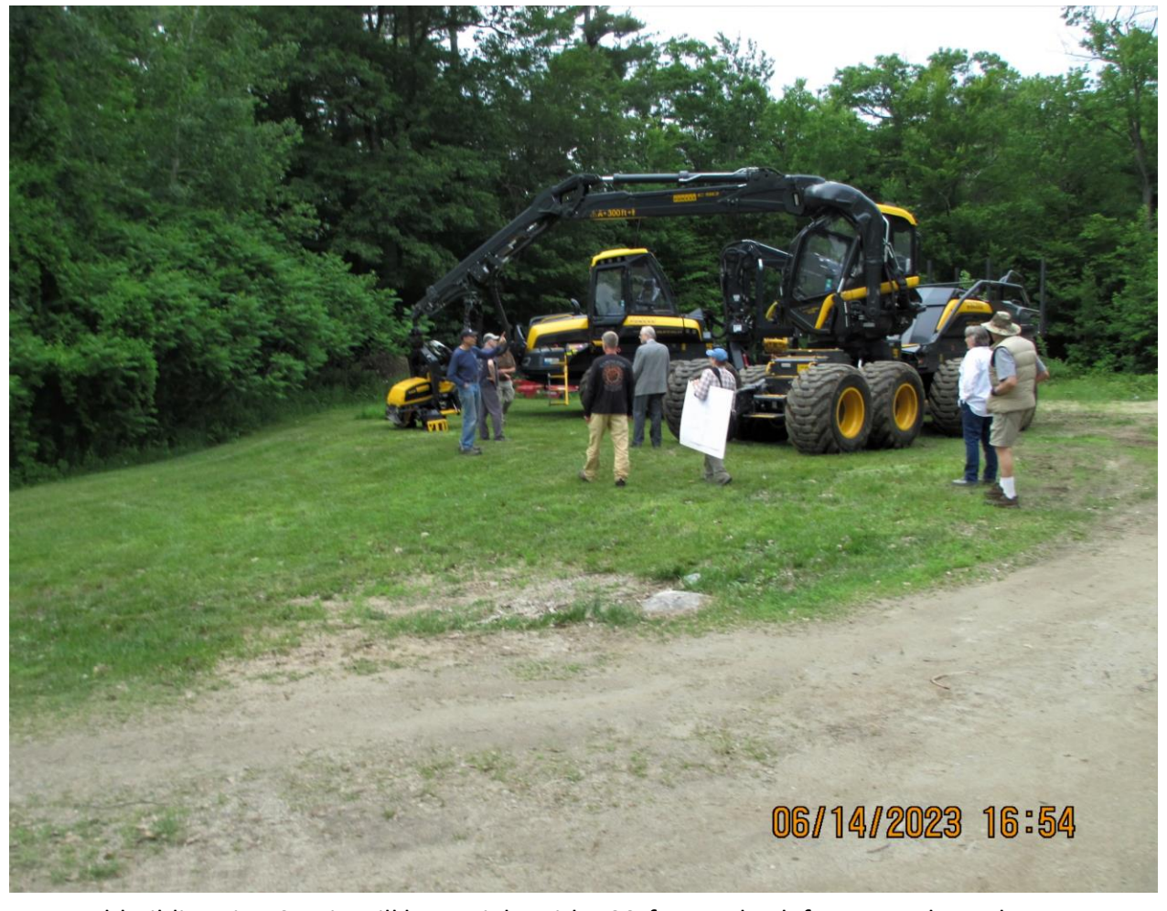
Proposed building site. Septic will be to right with 100-foot setback from Weed Brook.