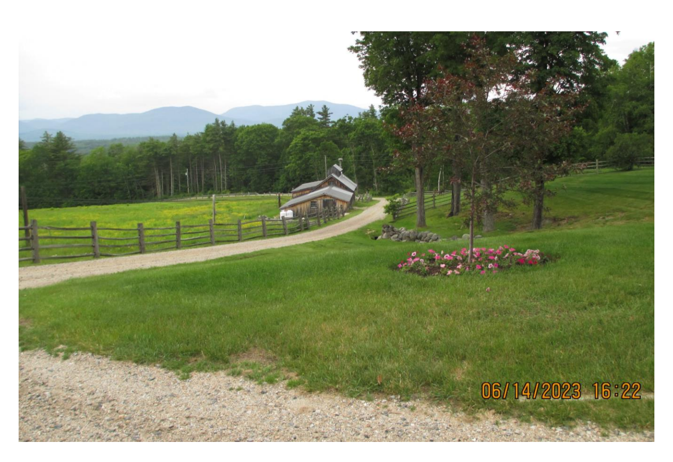
Top of driveway at barn. Second location to the right. View down to sugarhouse.