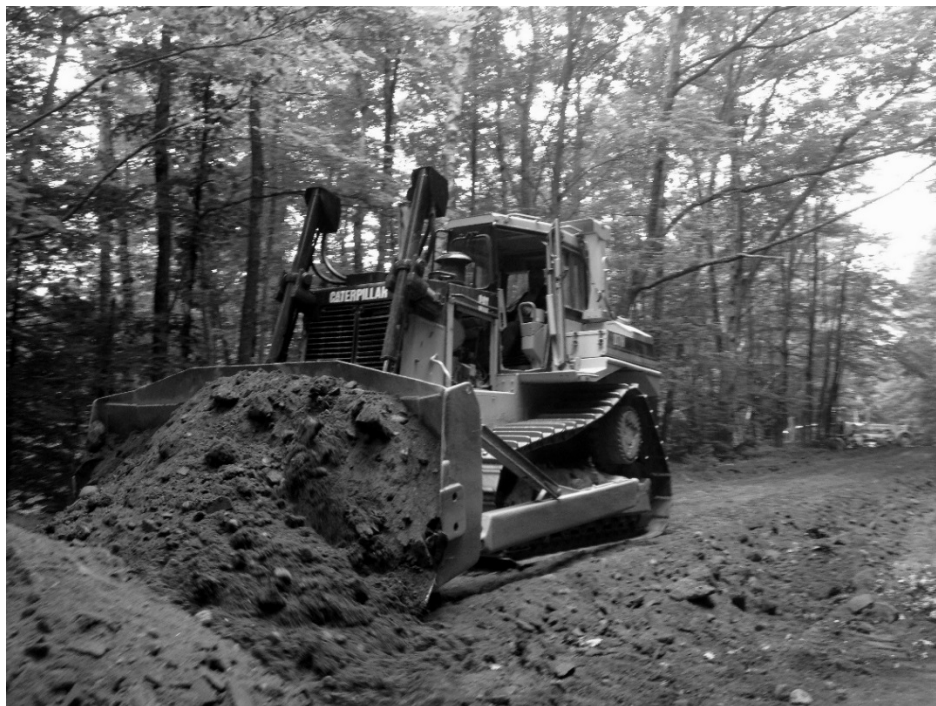
~ Mt. Israel Road Gets A Facelift ~

The paving project on Mt. Israel Road was completed in July and made a significant improvement in this section of the road. In September, the problematic culvert issues were addressed on Mountain Road. With the assistance of an engineer, thirty-inch culverts were installed to handle the heavy flash rains. Thank you to the landowners for the drainage easement to allow for these culverts to be placed. A scenic road cut was approved by the Planning Board for Wing Road and Bennett Street Loop to improve drainage issues and safety.