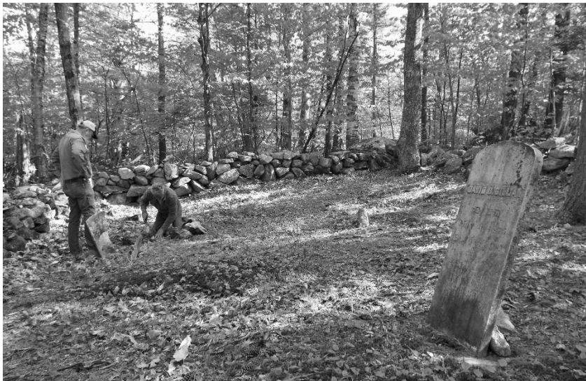
~ Gilman Cemetery ~

A favorite epitaph that starts "Look blooming youth as you pass by," presents a viewpoint of the trustees for the more than sixty old family burial grounds in Sandwich. We believe the people of this generation should care for cemeteries easily labelled "neglected." Once again, Carl Nydegger volunteered to properly restore broken grave stones in old family burial grounds. Carl restored stones in Eastman Cemetery, the David Gilman Cemetery, and the Thompson Cemetery. Carl also restored stones in Grove Cemetery and the Moulton/Beede Cemetery, and restored the old Daniel Smith Cemetery at Coolidge Farm. Roger Merriman and Peter Pohl helped as well. In total, Carl "fixed" more than twenty stones in several cemeteries. There is not enough space in this report to describe the wonderful work that Carl did for this town!