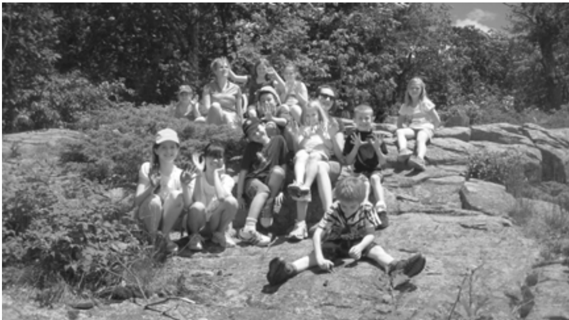
~ Five Days of Sandwich - 2011 ~

The campers enjoy a well-deserved break at the scenic viewpoint on the Oak Ridge Trail at the Castle in the Clouds. They are showing off their charcoal-covered hands after a natural art project.