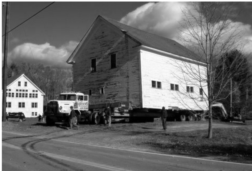
~ Moving Day for the Newest "Resident" in the Historic District ~

Quimby Transportation Museum – October 25, 2011