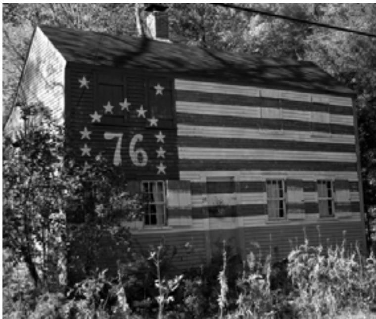
~ The Flag House ~

Applications and information are available in the Selectmen's Office.