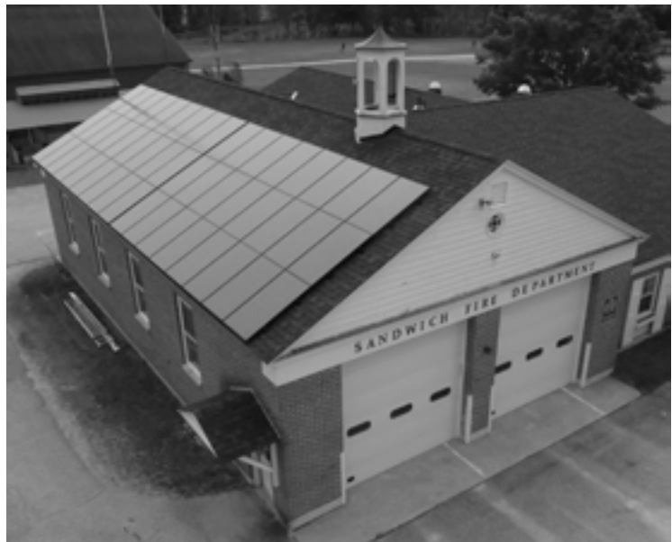
~ Solar Photovoltaic System at the Central Fire Station ~