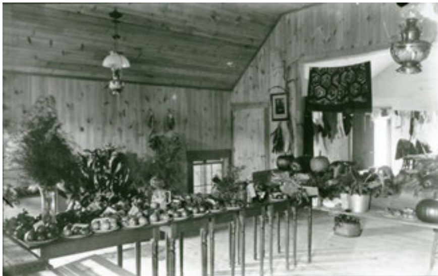
~ Sandwich Town and Grange Fair - 1906 ~