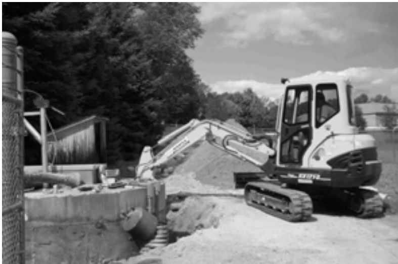
Repairs being made to the dosing tank at the Bean Road Pumping Station in August 2011.

The infiltration trend has continued downward since 2008 when infiltration peaked and an infiltration/inflow assessment was initiated. The infiltration rate in 2011 was similar to the rate in 2004 when detailed records were compiled. Reduced infiltration may be partially the result of repairs made to the Bean Road Pumping Station dosing tank in August of 2011.