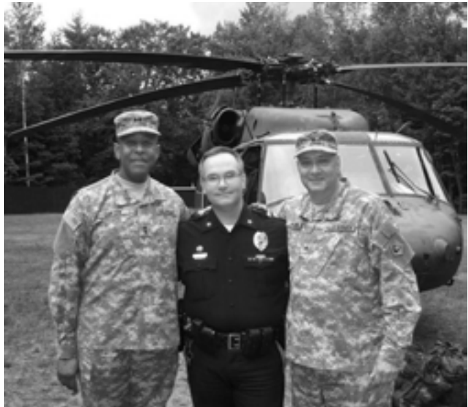
~ Camp Hale's Special Guests ~

This summer we were able to dedicate extra time to motor vehicle enforcement and speeding complaints due to a Traffic Enforcement Grant we received from the NH Highway Safety Agency. In addition, we received a grant from the U.S. Forest Service to patrol the Sandwich Notch. Lastly, NH Department of Justice granted us an extension to our Enforcing Underage Drinking Laws Grant, which enabled us to increase our patrols to areas of town which are known for underage drinking.