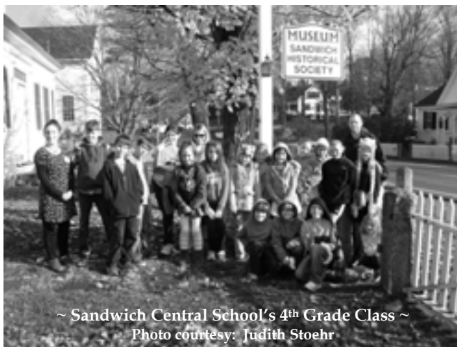
~ Sandwich Central School's 4 th Grade Class ~

The Society's Annual Meeting was held in November at the Doris L. Benz Community Center and included a presentation on the moving of the Transportation Museum. In December, the Society participated in Christmas in