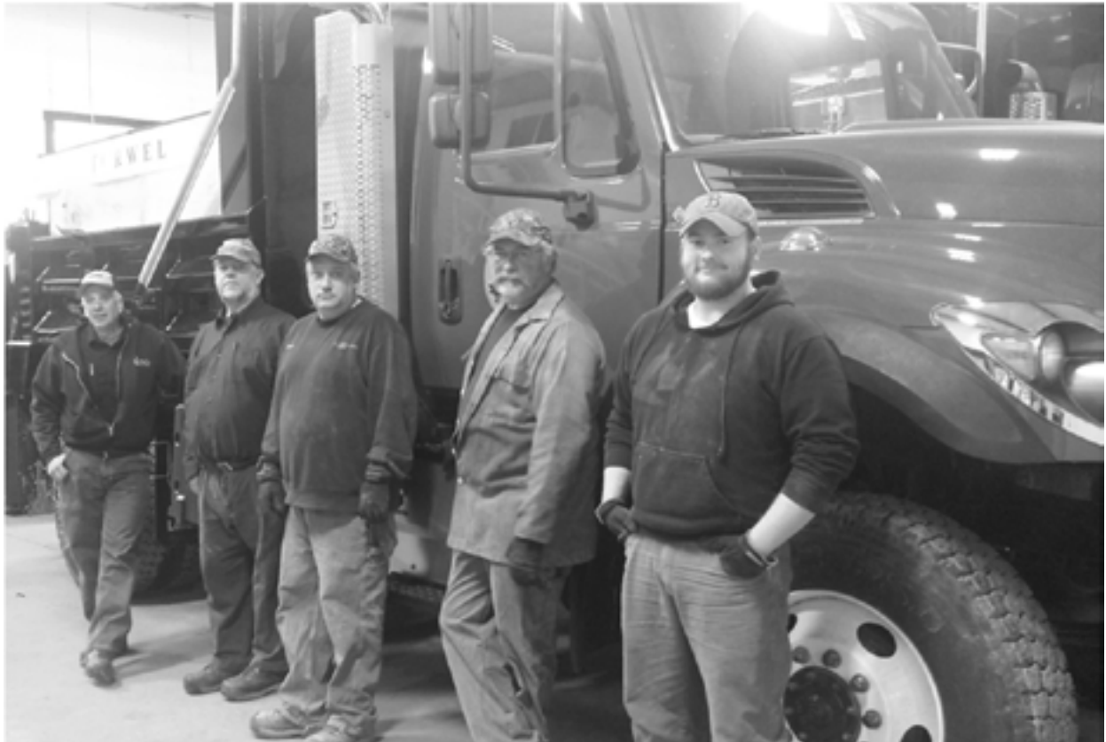
~ The Fabulous Five ~

The fall extended into December with milder temperatures and no snow or icy conditions right through Christmas. This allowed the department to clean many culverts and replace a culvert on Coolidge Road as it failed due to beaver activity.