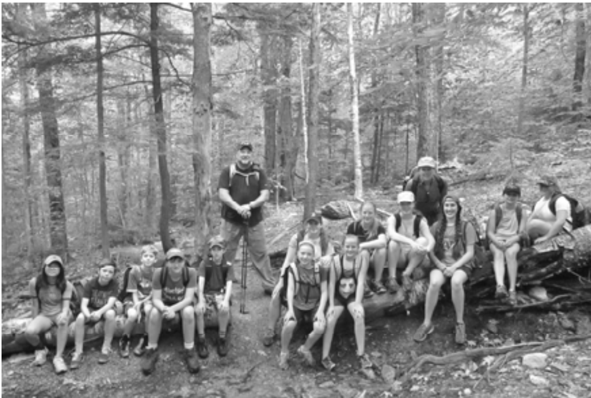
~ Five Days of Sandwich – Session Three (2015) ~

Campers enjoy a break while hiking the trail to Welch-Dickey, an expansive granite outcropping.