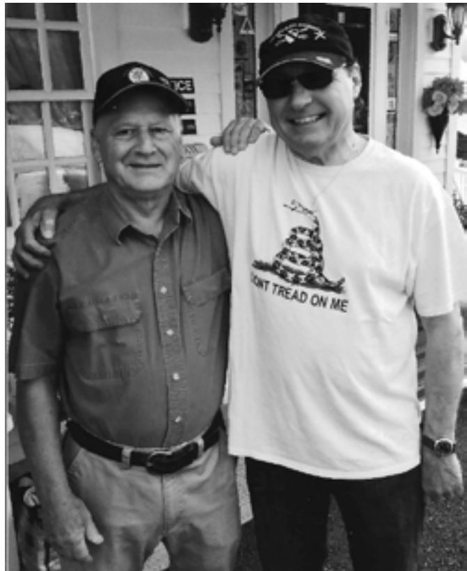
~ Bestfriends ~