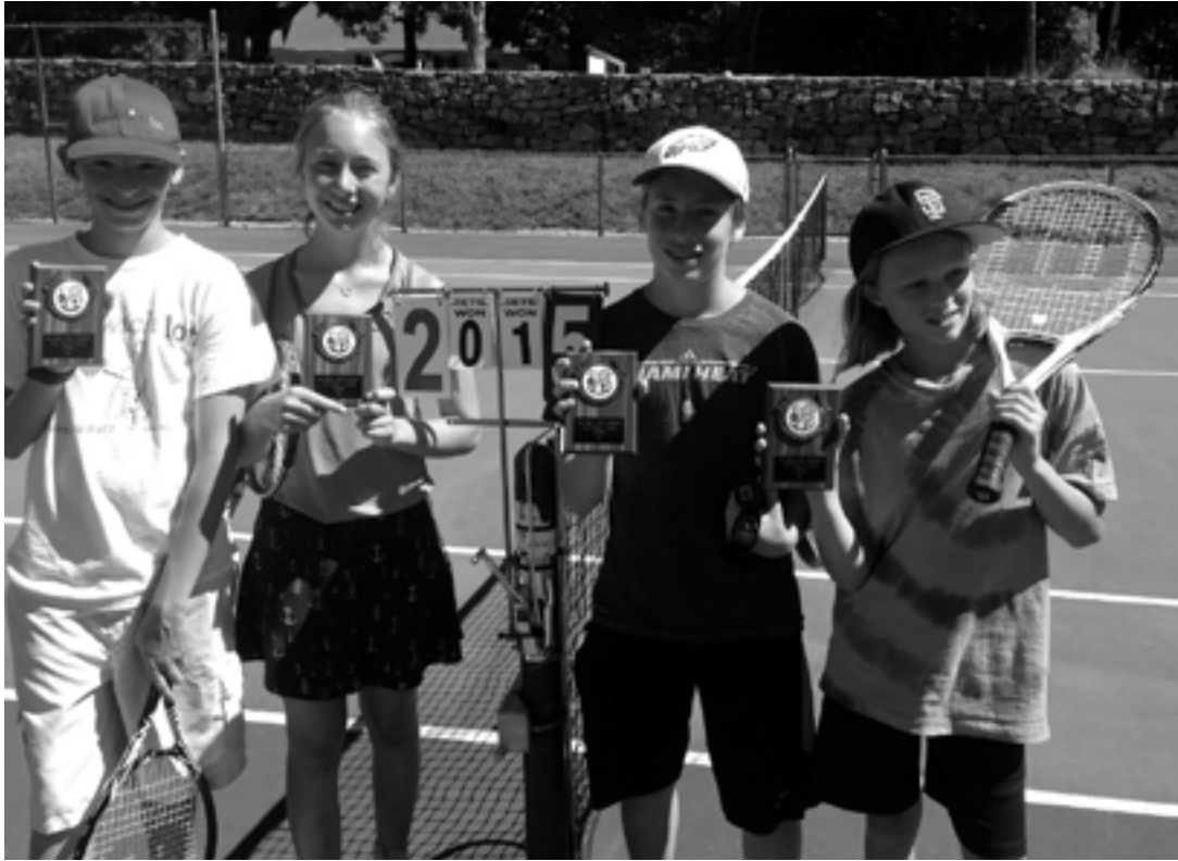
~ Youth Tennis Doubles Champions!! ~

Youth Sports: Youth sporting opportunities are one of the fundamental elements of this department. The department saw impressive participation in all of our youth programs. Youth sports offered in the past year included: Nordic and alpine skiing, soccer, tennis, swimming, basketball, and tee-ball. The goal of youth sports for this department is to create and foster inclusive programs so that children can participate in and enjoy a variety of activities.