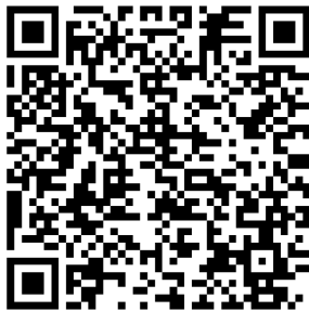
Residential Water & Sewer Rates