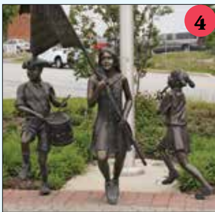
4 Long May It Wave sculpted by Blair Muhlestein. Three children, recreating the battle weary flag-bearer and fife and drum players of the Revolutionary War as they play. This sculpture takes on added significance as we remember the events of September 11, 2001. We continue to take pride in our flag and what it symbolizes and remember to rejoice in our freedoms as Americans. We also are reminded that the freedoms we enjoy came about because of the sacrifices of many and that it takes continued vigilance to stamp out hatred, fostering understanding and respect for all the peoples of this world.