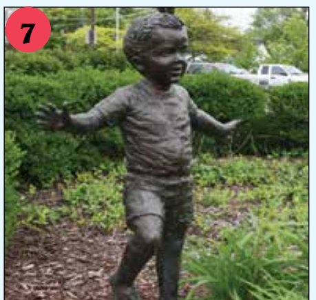
Heading Out sculpted by Dennis Smith. Heading Out is an image about beginnings. Think about the mind and vision of a child; the trial and error—the pure work that accompanies the task of learning to walk. Beyond the falls, the bumps and bruises of the effort, finally those first steps take form, and the child heads out into the wide and endless vision of a world filled with new things and endless places to explore.