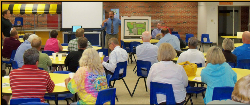
Stakeholder Partnership Action - Roanoke Rapids Graded School District (RRGSD), Smith Sinnett Architecture, UCPCOG, Mid-Atlantic Associates, EPA and NC Brownfields programs partnered to carry out environmental site assessments, community outreach and planning.