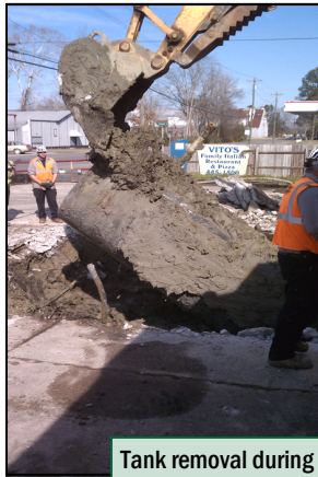
Tank removal during site assessment work in Enfield, NC

The program can provide a property owner and/or prospective developer with EPA grant supported Environmental Site Assessments (ESAs) to evaluate the potential presence and extent of hazardous and/or petroleum substances.