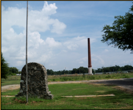
Existing Site - Remnants of former textile mill in Roanoke Rapids