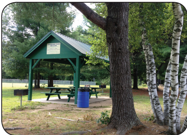
FRIENDSHIP PARK PAVILION PICNIC AREA