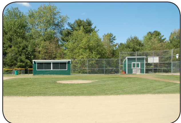
FRIENDSHIP PARK LITTLE LEAGUE FIELD

There is also a softball field at Lions Field and a basketball court/multi-purpose area at town hall.