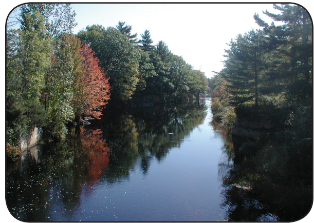
LITTLE OSSIPEE RIVER

10. Except for RSU #57's school gymnasiums and the town hall recreation room, there are no public indoor facilities that are suitable for physical activities in Waterboro. Massabesic Health Resources, P.A. includes private fitness services to its patrons in its facility. Kraze Fitness, Paradox Fitness and Brooks Dance Center provide private activity space for their patrons.