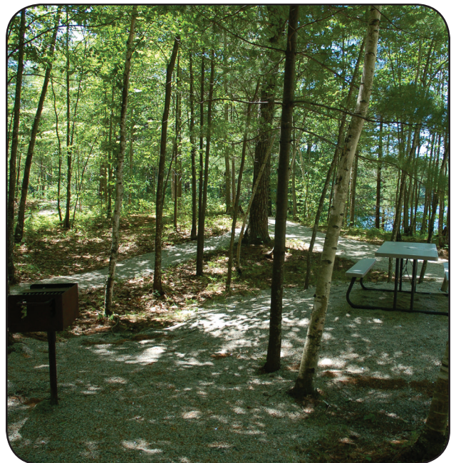
BOB FAY MEMORIAL PARK PICNIC AREA