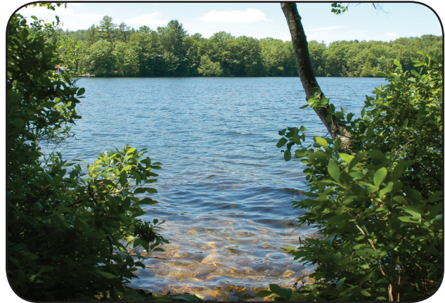
BOB FAY MEMORIAL PARK BEACH AREA

3. Waterboro does not have any public use swimming pools although there are two pools (one indoor, one outdoor) on the Waterboro side of Lake Arrowhead Community (a private home-owner's association) and LAC has private playgrounds.