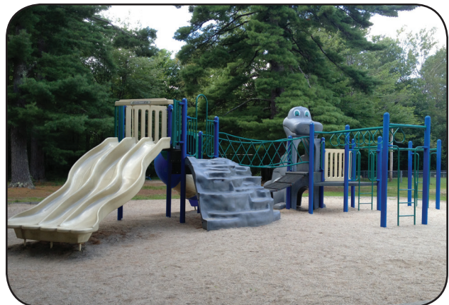
FRIENDSHIP PARK PLAYGROUND

4. There is one Waterboro owned and operated playground in town at Friendship Park. There is also a playground at RSU 57's Waterboro Elementary School.