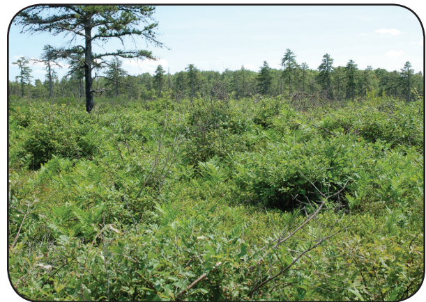
WATERBORO PINE BARRENS

12. The Waterboro Pine Barrens, owned, maintained, and managed by the Nature Conservancy, in the northwestern section of town is a serene woodland preserve of over 2,000 acres and is home to Maine's best example of a boreal pine barrens.