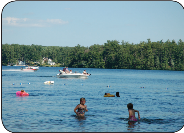
GOBEIL PARK BEACH AREA

The town also owns Love Island on Lake Arrowhead.