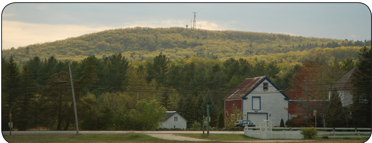
VIEW OF OSSIPEE MOUNTAIN FIRE TOWER FROM ROUTE 5

Funding such a capital project would require great community creativity, participation, commitment, and effort. It is suggested that organizations like the Harold Alfond Foundation be explored along with other grant sources, as well as public/private partnerships.