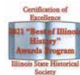
Award Winning Volume 2