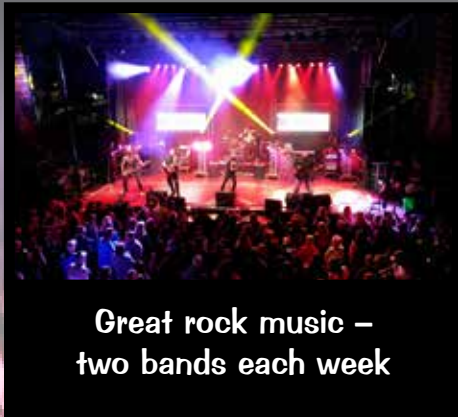
Great rock music – two bands each week

Thursday evenings in June, July and August