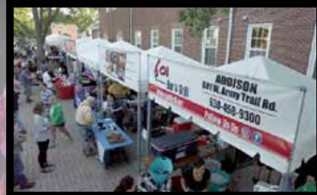
Delicious food from Addison restaurants

Historical Museum Craft & Vintage Fair, and weekly historical presentations