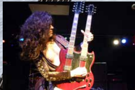
July 29: Kashmir, with Shade of Blues