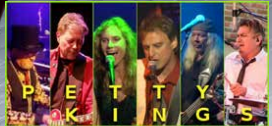
July 15: Petty Kings, with Sonic Road Trip