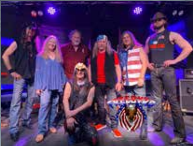
July 1: Free Byrd, with Almost Brothers and Fireworks Finale