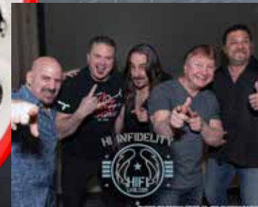
Aug. 26: Hi Infidelity, with Neverly Brothers

Rock 'n Wheels, the Village of Addison's signature summer concert series, kicks off the 10th season on July 1!