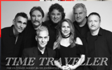
Aug. 19: Time Traveller, with Polarizer