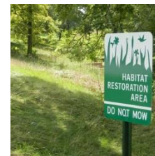
Natural Area Restoration Provides Aesthetics and Ecological Functions