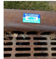
Storm Drain Medallion "No Dumping – Drains to River"