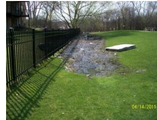
Drainage way after the clog was cleared by Public Works