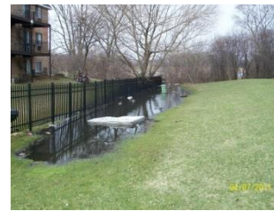
Drainage way is clogged by illegal dumping

CONTACT THE VILLAGE ENGINEER AT (630) 693-7530 FOR THE BEST AVAILABLE INFORMATION CURRENTLY AVAILABLE.