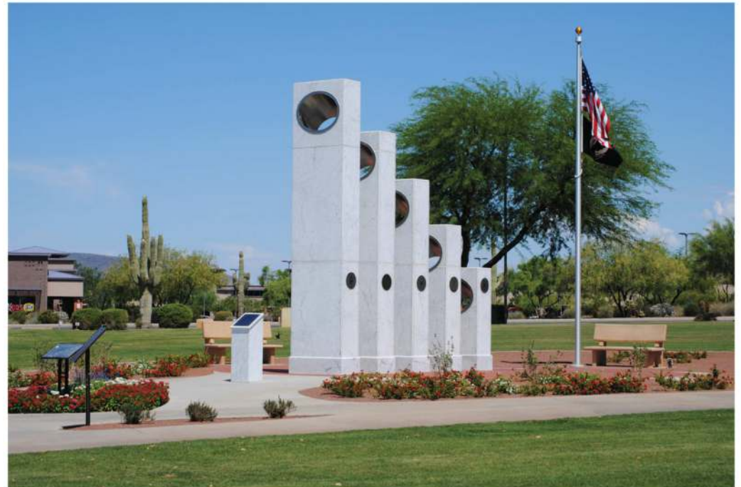
The Anthem Veterans Memorial was dedicated in 2011 and has since had thousands of visitors, including schoolchildren who have visited the monument to learn about military history.

According to the meeting's minutes, the Anthem Veterans Memorial's (AVM) tentative expansion has been spearheaded by a volunteer planning committee consisting of several parties who initially helped with it-