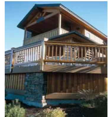
Enclose under decks so firebrands do not fly under and collect.