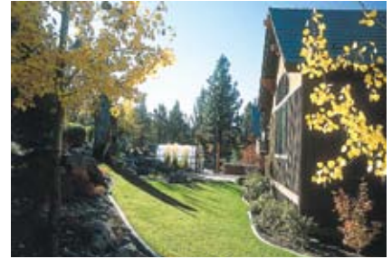
Use grass and driveways as fuel breaks from the house.