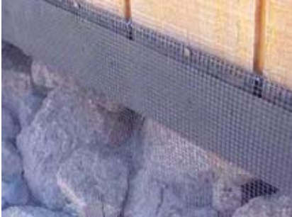
Cover openings with 1/8” metal screen to block fire brands and embers from collecting under the home or deck.