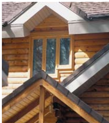
Enclose eaves and soffits.