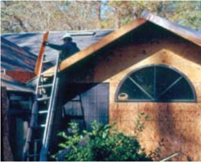
The roof is the most important element of the home. Use rated roofing material.

“When considering improvements to reduce wildfire vulnerability, the key is to consider the home in relation to its immediate surroundings. The home’s vulnerability is determined by the exposure of its external materials and design to flames and firebrands during extreme wildfires. The higher the fire intensities near the home, the greater the need for nonflammable construction materials and a resistant building design.” – Jack Cohen, USDA-Forest Service