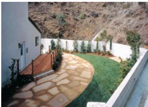
Create a cinder block wall around the perimeter of your yard and use grass and slate to break up the landscape.