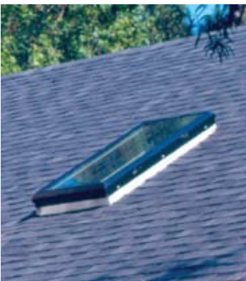
Use glass skylights; plastic will melt and allow embers into the home.