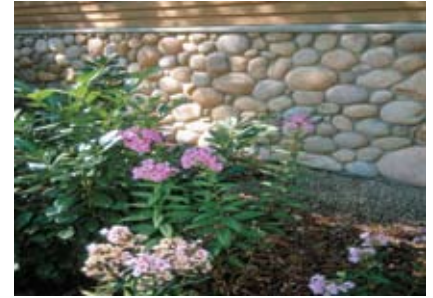
Use faux brick and stone finishes and high-moisture-content annuals and perennials.