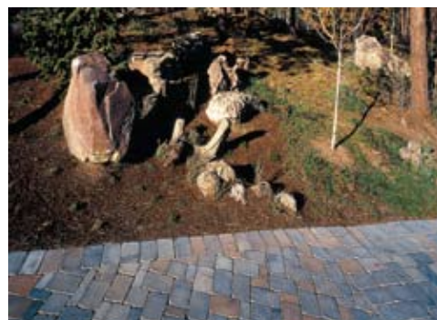
The use of pavers and rock make for a pleasing effect and creates a fuel break.