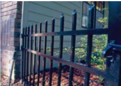
Use non-flammable fencing if attached to the house such as metal.