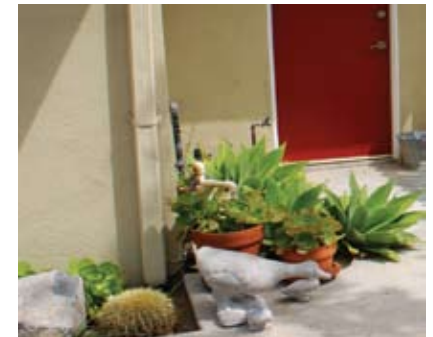
Use groupings of potted plants that include succulents and other drought resistant vegetation.