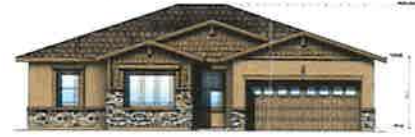
FRONT ELEVATION C