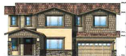
FRONT ELEVATION C