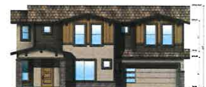
FRONT ELEVATION D