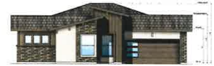
FRONT ELEVATION D