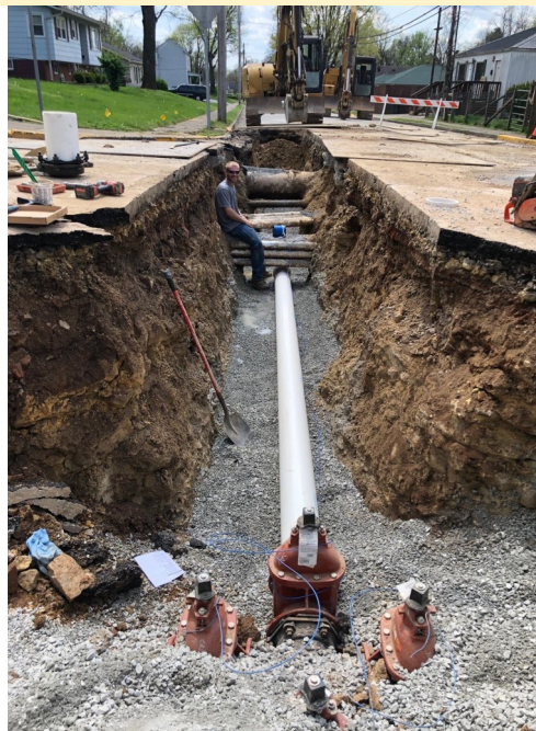
New 8" Water Main under construction on South 4th Street near West Muir Ave

1990s. See the back page of this report for more information on how this helps protect human health and the safety of Bardstown's drinking water.