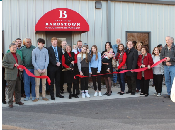
Ribbon cutting ceremony for the Lawrence A. Hamilton Public Works Center

In 2022 the City also launched a new initiative requiring customers submit documentation of annual testing of their backflow prevention devices to confirm they are working correctly. Backflow devices have been required by local and state plumbing, fire, and utilities codes since the