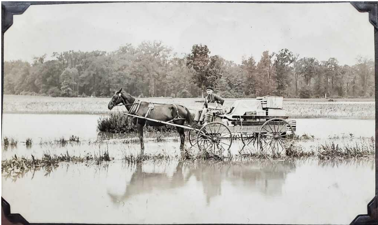
East Side of Woodward, circa 1930.

A display of newly added pictures taken in the early 1930s is now on display in the museum. This photo shows the trolley that used to run from Detroit to Pontiac with what became Roseland Park Cemetery in the background.