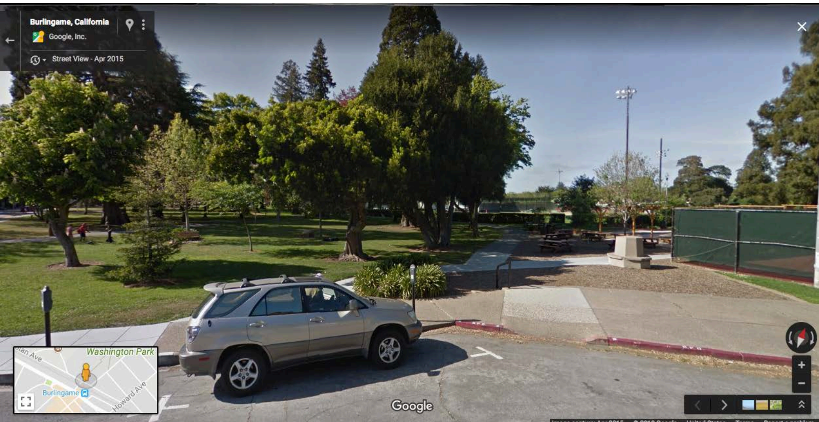
360 View Link