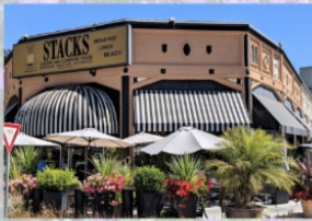
2021 Winner - Stacks