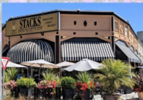
2021 Winner - Stacks