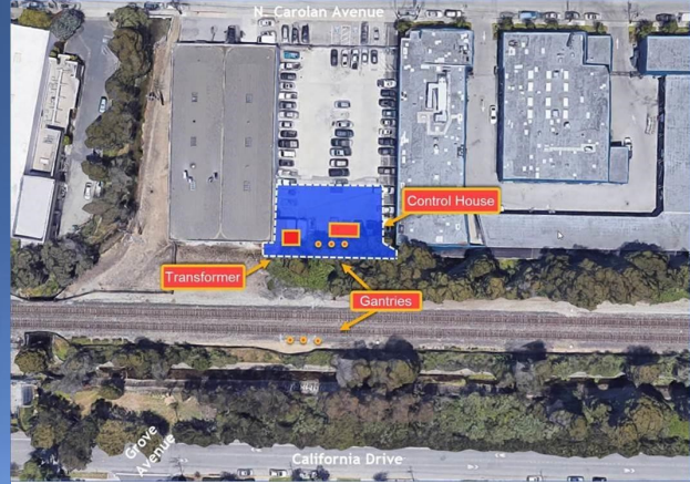
Above: Burlingame Paralleling Station Layout