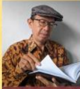
Author: Junaedi Setiyono