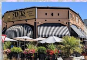
2021 Winner - Stacks