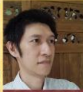
Translator: Oni Suryaman