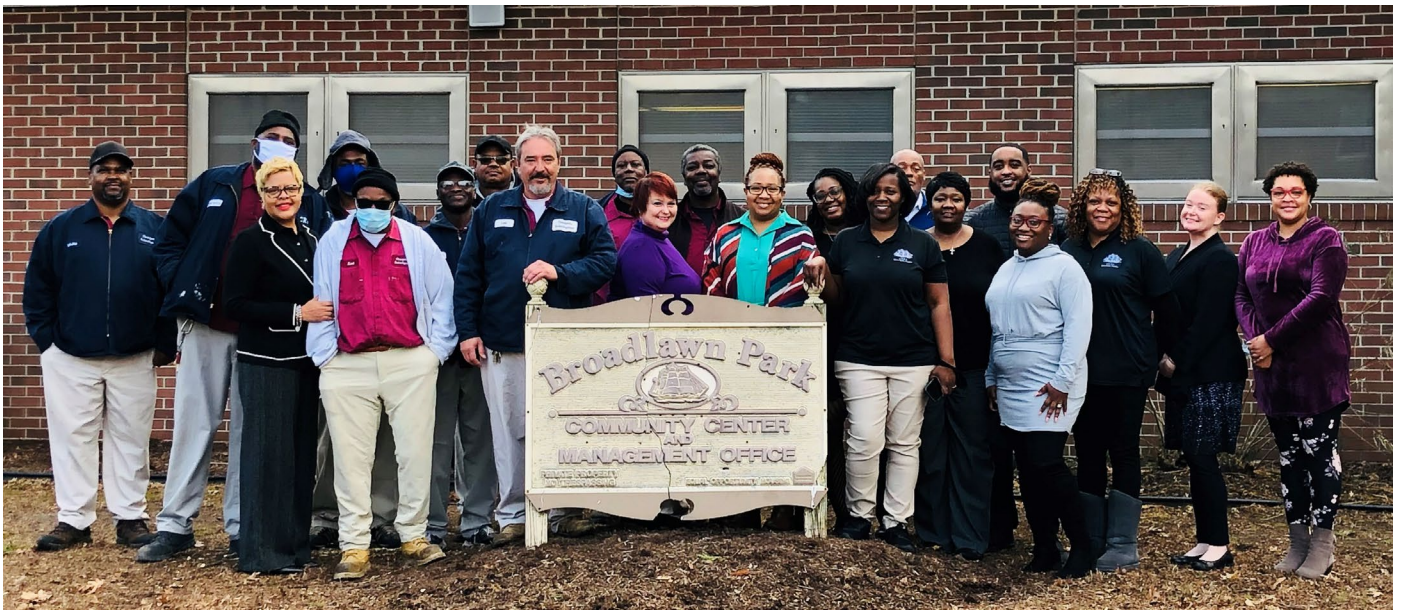
The 2020 CRHA Housing Operations Team