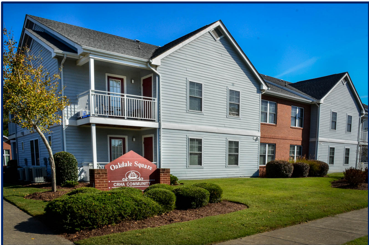
Oakdale Square is a 42-Unit Family Affordable Housing Community Developed by CRHA / VCDC in 2005

Oakdale Square is a 42-unit affordable housing development that was developed in 2005 in partnership with the Virginia Community Development Corporation (VCDC) aka Vibrant Communities Drive Change . CRHA operated the project and provided all property management and compliance services for VCDC until December 2020 at which time CRHA began assuming the exclusive ownership of the property. Pending approval from Virginia Housing, Oakdale Square will remain in the CRHA/Blue Heron portfolio for the foreseeable future. Most importantly, our agency will be able to preserve this affordable housing asset for decades to come.