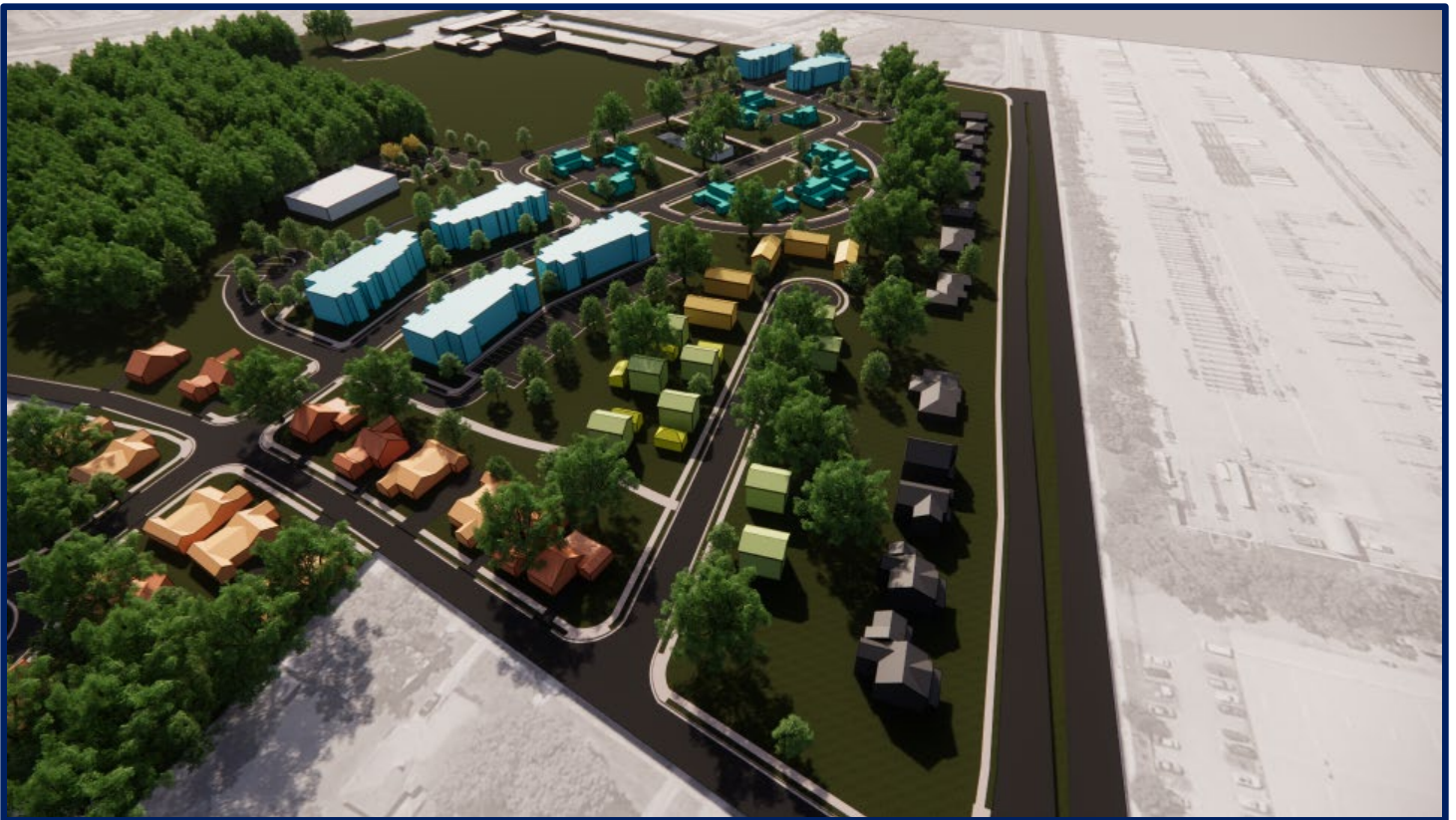
The Re-Imagined Broadlawn Park as seen from Atlantic Avenue