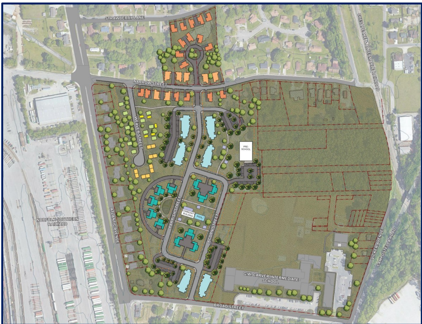
The Newly Re-Imagined Broadlawn Park Site Plan from October 2020