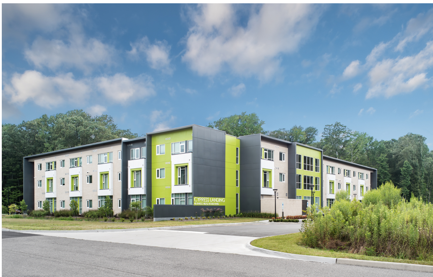
Cypress Landing is a 50 Unit Apartment Community in Chesapeake that Exclusively Serves Homeless/Low-Income Veterans Architect: VIA Design