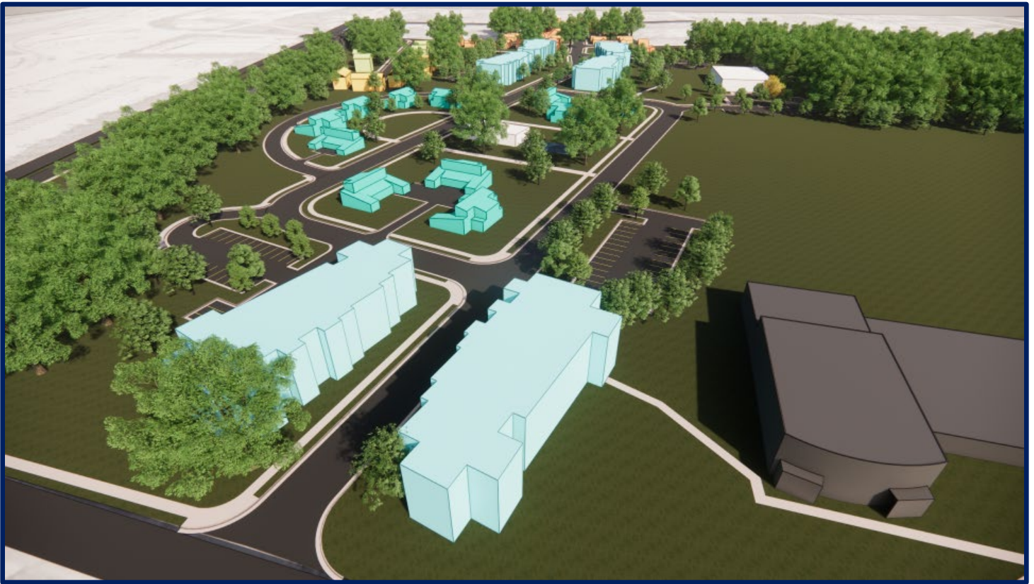
The Re-Imagined Broadlawn Park as seen from Carver Intermediate School at Broad Street