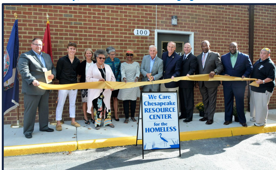
Honorable Mayor Rick West is joined by multiple members of the Chesapeake City Council and other City Leaders to Officially Open the We Care Resource Center on September 18, 2019.