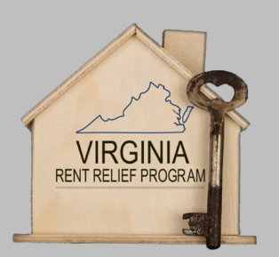
Virginia Tenant and Landlord Resources