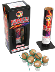
Reloadable Shell Device