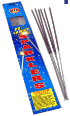
Sparklers & Sparkler Trees