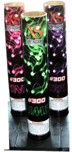
Single Tube Device with Report