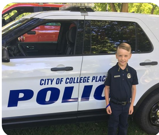
Chief Emery! College Place Police's "Chief for a Day"