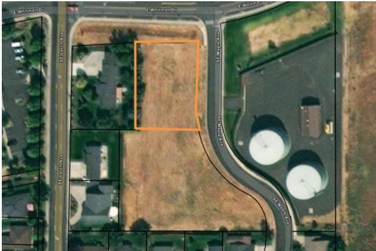
Map 3: Maple & Whitman Site (Potential Park Property bounded in Orange)

The potential park site (0.49 acres) would take the northern half of the property identified as 80 SE Maple Avenue. The site is currently encumbered with a water utility easement/drainage from the new well site to the south of it to the large ditch on the north side of the property. This property has good visibility from the southwest corner of Whitman Drive & SE Maple Avenue. Parking exists along SE Maple Avenue.