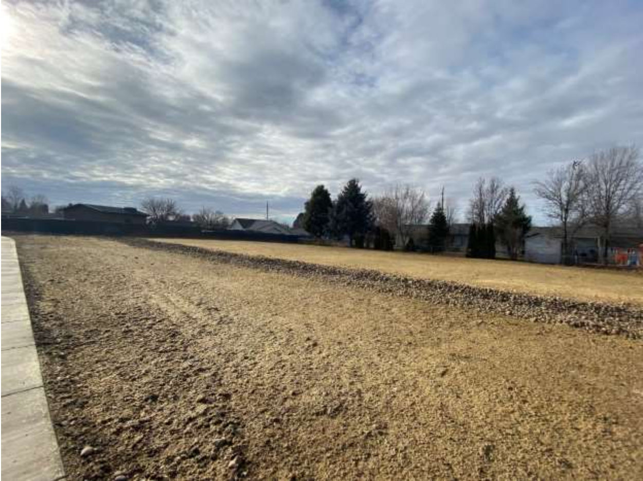
Picture 2: Proposed Park site viewed from southwest corner of Whitman Drive & Maple Avenue.