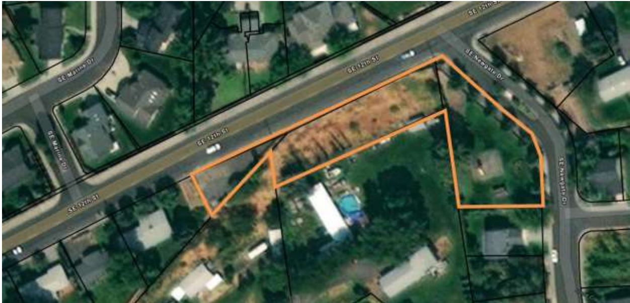
Map 2: Autumn Meadows Park (Right) and Perseverance Park (Left Triangle) Everything in orange boundary is City owned.

Autumn Meadows Park (0.43 acres) was owned by the Autumn Meadows Homeowners Association and was recently assumed by the City. The park has a wooden shelter and swing set. Primary access is off of SE Newgate Drive on the east boundary of the park. The site has a fence around it and a tall hill to the north of it. The hillside south of 12 th as well as Perseverance Park (triangle piece) is under ownership of the City.