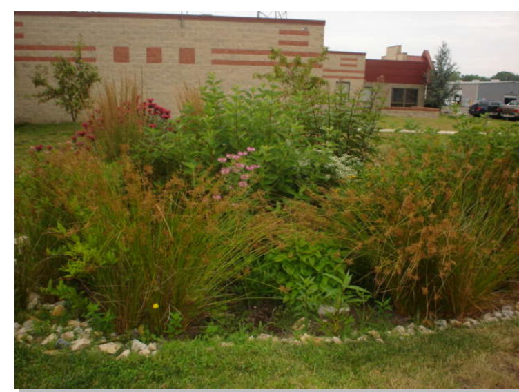
Photo of a demonstration rain garden at the Gloucester County Government Services Building in Clayton, NJ 18 months after planting.