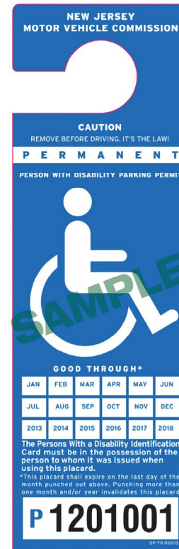
FIGURE 2: Permanent Person with a Disability Placard