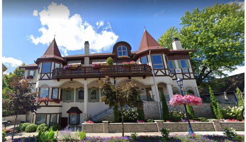
Figure 2: The clear Bavarian architecture and attention to detail as well as roof details, flower boxes, canopies and landscaping help reduce the bulk and size of the building and complement the surrounding area.

4. Buildings shall possess architectural variety but enhance the overall cohesive community character. Buildings shall provide architectural features, details and ornaments such as archways, colonnades, towers, cornices or peaked roof lines.