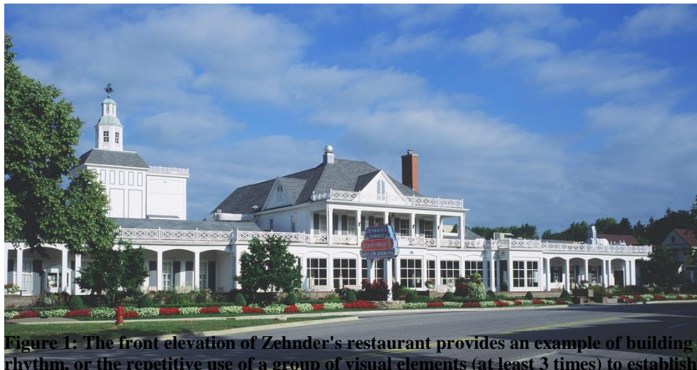
Figure 1: The front elevation of Zehnder's restaurant provides an example of building rhythm, or the repetitive use of a group of visual elements (at least 3 times) to establish a recognizable pattern.

1. Buildings shall front towards and relate to the public street. This includes entrances. Buildings shall be located to create a defined streetscape through uniform setbacks and proper relationship to adjacent structures. Proper relation to existing structures in the area shall be maintained through building mass, proportion, scale, roof line shapes and rhythm.