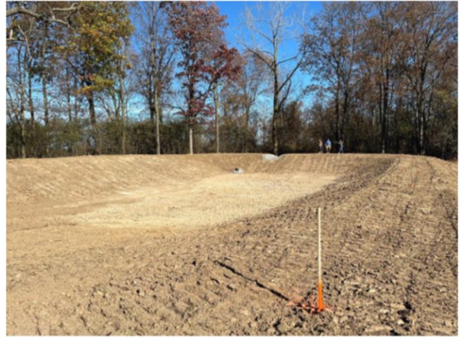
Pictures of a large basin installed on Armstrong Road. Pictures are during construction (left) and after completion, prior to stabilization (right).