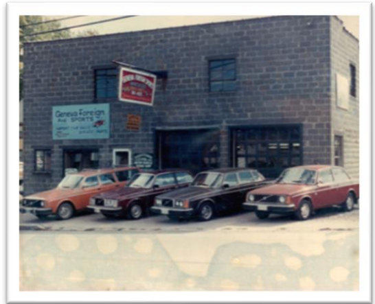
Geneva Foreign & Sports 1972 (Top) and 2020 (Bottom)