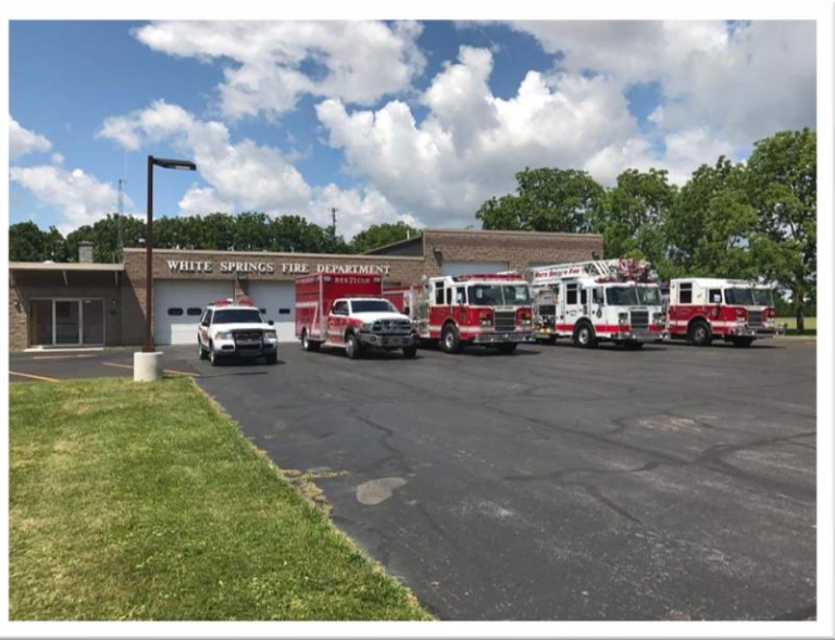
The White Springs Fire Association's firehouse on CR6

The WSFA has been in existence for over sixty years, having been established in 1957. It protects lives and properties from County Rd 4 in the Town of Geneva south to Turk Rd. Its firehouse is on CR 6. Property in the fire district is evenly divided between residential and commercial entities. WSFA has seen a lot of growth and development within its fire district, and the spread of multi-story hotels, apartment complexes, and traffic congestion (particularly at the intersection of CR6 and 5 and 20) present many challenges. The equipment WSFA uses to service its district are a 105' ladder truck, 2 class A fire engines, and 2 rescue trucks. It is the busiest of the Town's three fire associations with an annual call volume of approximately 360 incidents.