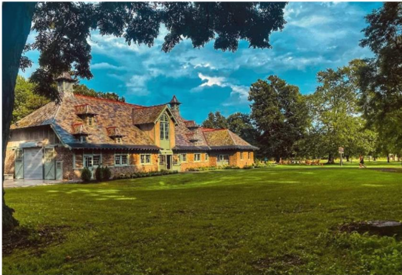
Brewery Ardennes on Snell Rd