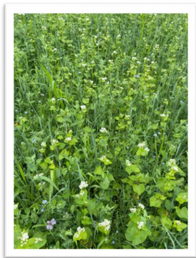
Pictured from left to right Hydroseed application, initial seed germination, and cover crop stand in mid July