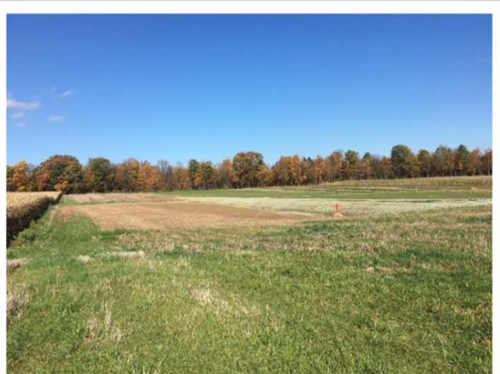
On the left is Bruce Reed with one of the risers in the foreground.