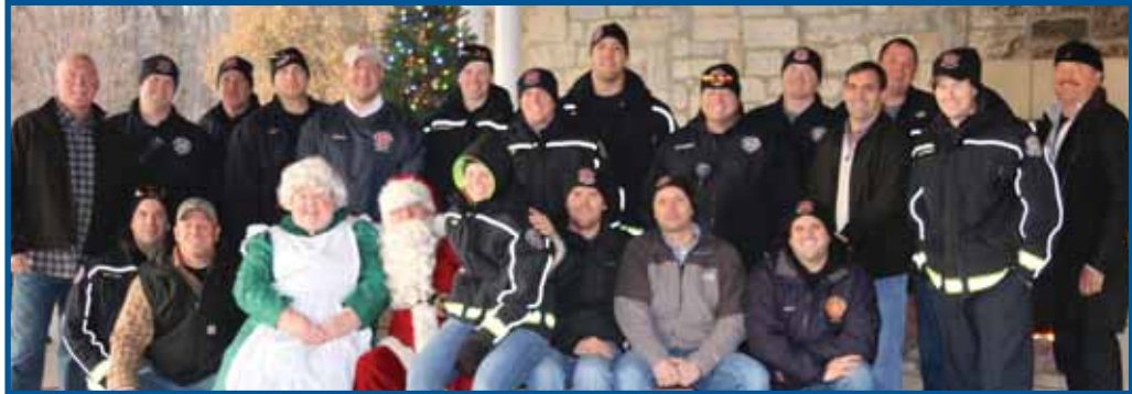
Firefighters, Santa and Mrs. Claus at McNamara Park for the 2015 Firefighters for Families Food and Toy Drive.

Public information is governed by Ohio's Public Records Law. There are clear legal requirements that the Township must follow in making the "people's information" available. While there is a formal process to request public information, the Township has and will continue to proactively make information available on the Township's programs, issues, finances and meetings. The complete audio recording of each Trustee and Zoning Commission meeting is on the Township website. Printed minutes are also posted for each meeting. The bi-monthly newsletter provides general information on activities and programs, as well as a synopsis of