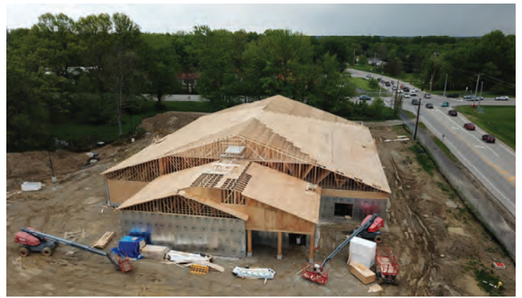
Police station construction progress on May 22, 2020

If the Ohio Department of Health lifts restrictions on gatherings of greater than ten people, the Township will host the annual summer event Movie Night at McNamara Park featuring Toy Story 4 on July 11 and A Beautiful Day on August 8. Visit the Township website at www.GenoaTwp.com/MovieNight for updates.