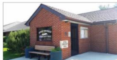
Township Hall, $100 fee and $100 security deposit