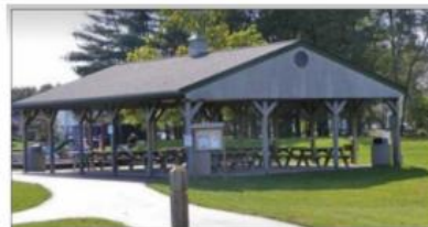
Freeman Road, $25

In order to reserve a shelter or the Township Hall, it is recommended that you first call the Administrative Office at 614-895-1126 to verify that your preferred date, time and location are available. Once you've found an available date, proof of residency in the form of a utility bill or driver's license is required to complete your reservation in addition to a completed reservation form (available online) and payment in-full.