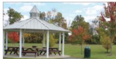
Center Green, $25