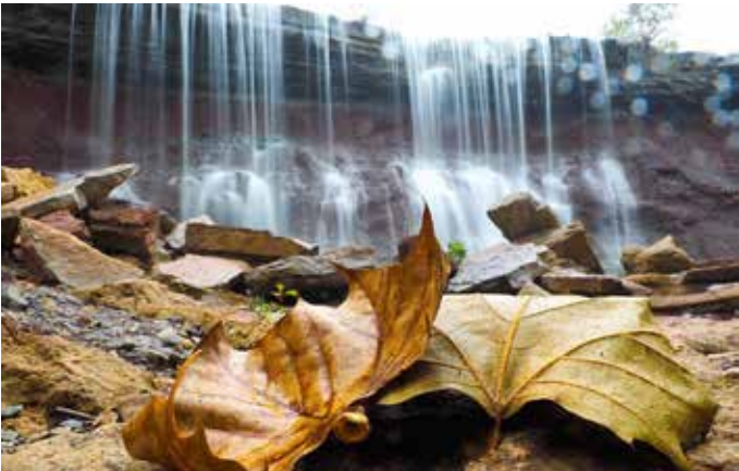
The cover features Cowley County Waterfall at Cowley State Fishing Lake, west of Dexter on US Hwy. 166.