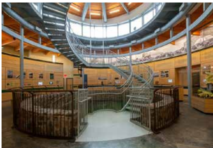
Big Well Museum, Greensburg