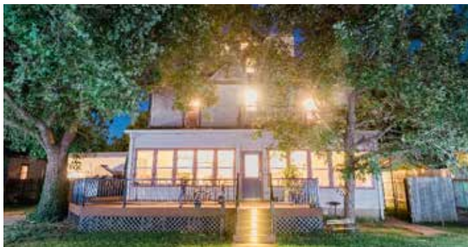
Wolf Manor, Ellinwood