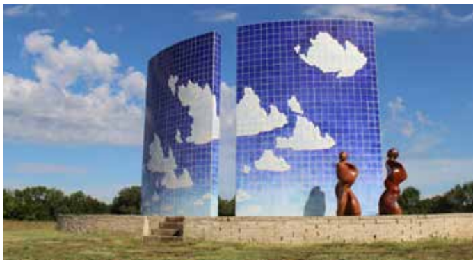
Blue Sky Sculpture in Newton, KS

1205 E. First St., Newton, KS 316-804-4688 www.comfortinn.com/ks158