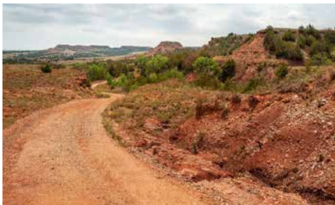
Gyp Hills near Medicine Lodge: Kansas like you've never seen before!

Smith Log Cabin, Carry Nation Home, 1884 bank robbery exhibits