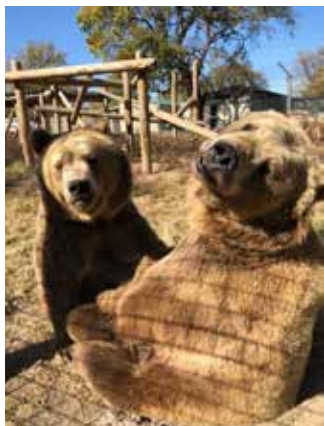
Brit Spough Zoo, Great Bend

106 N. Main Ellinwood, KS (620) 566-1006