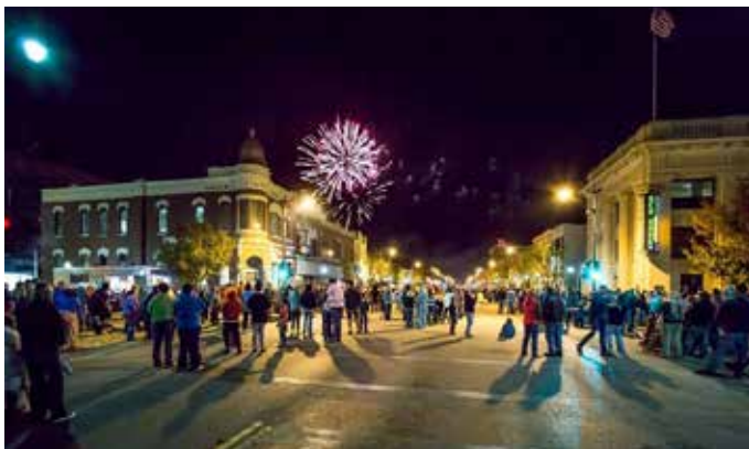
Arkalalah, Ark City

Located on the Chisholm Trail, historical markers in downtown Caldwell provide an unusually complete view