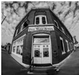
Historic Wolf Hotel, Ellinwood

easy access along Highway 56/K-96. Ellinwood is located between Quivira Wildlife Refuge and Cheyenne Bottoms making it an easy drive for the nature enthusiasts, bird watchers and hunters. Visit our website for events, news and photos.