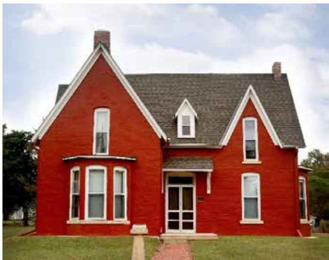
Salter House Museum, Argonia

Fun fact: Her name was filed as a joke for position of mayor.