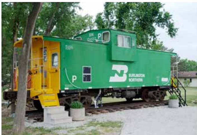
Evergreen Inn, Pratt