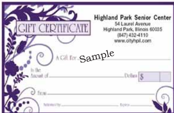
A Senior Center gift certificate is a perfect gift for the holidays!

The Highland Park Senior Center is thrilled to partner with a variety of local theater and concert venues to offer members specially negotiated discounted ticket prices. Senior Center members will be notified of special offerings via e-mail. In order to pick up tickets at the discounted price, you must present your current "Discounted Ticket Pass" issued by the Highland Park Senior Center along with a photo ID. Discounted Ticket Passes are not transferable and there is a limit of one (1) ticket per member, per performance. Discounted Ticket Passes are issued in conjunction with Senior Center membership and may be picked up in person during regular business hours; a photo ID is required.