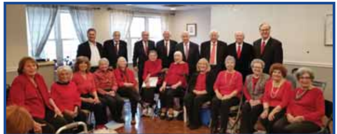
The Highland Park Senior Center Laurel Larks take their show on the road!