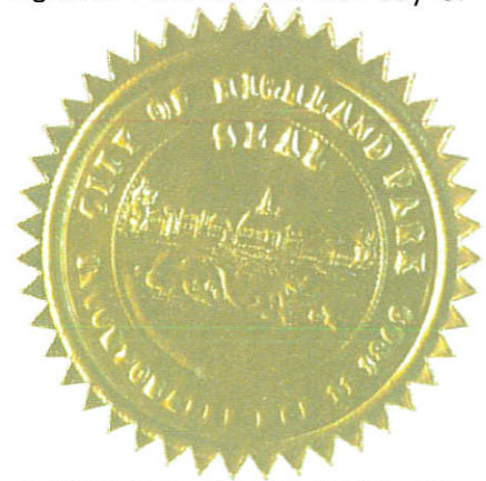
_____ City Seal