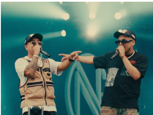
Gego Y Nony (6-7:30 PM)