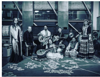
Surabhi Ensemble (2-3:30 PM)