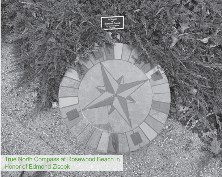
True North Compass at Rosewood Beach in Honor of Edmond Zisook

Please note that this page is submitted, written and edited by the Park District and does not reflect the views or opinions of the City.