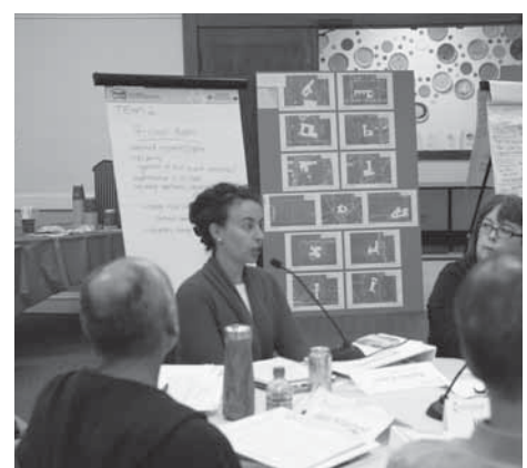
First meeting of the Long-Range Planning Commitee on July 28, 2018

Take Part in an Online Thoughtexchange Exploring 9, 8, and 7 School Building Models for District 112 August 8 - August 22