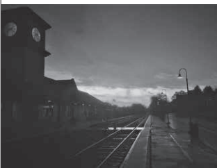
Daily Life Winner - Lynn West

Congratulations to the winners of the Capture the Heart of Highland Park Photo Contest! For the sixth year, the City sought to illustrate the character of the community and capture the heart of Highland Park through a community photo contest. The contest was open to all residents and businesses in Highland Park, and more than 20 photographers submitted a total of 127 photographs. Photos were accepted in the following categories: Arts & Architecture, Daily Life, Environmental, Pets of Highland Park, and Portraiture. All submissions were evaluated in a blind judging process by the Cultural Arts Advisory Group. Winning photos will be featured on the City's Facebook page and winners will be recognized at an upcoming City Council meeting.