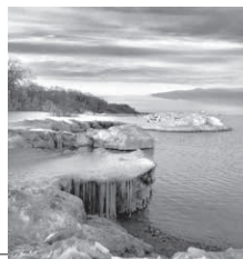
Image on Left: Environmental Winner & Community Favorite - Lynn West