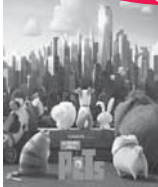
The Secret Life of Pets

Watch this animated adventure while relaxing at the pool. This movie is rated PG. Flotation devices are allowed at the discretion of the staff. A suggested donation of $5 will benefit the Parks Foundation of Highland Park. For more information, call 847.433.3170.