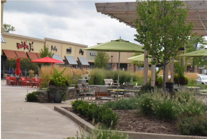
2018 Beautification Award Recipient Crossroads Shopping Center, 113-295 Skokie Valley Road

The Business and Economic Development Advisory Group is accepting nominations for the 2019 Mayor's Beautification Awards which recognize Highland Park property and business owners that have made improvements to enhance visual appeal consistent with the environment and the community. Award recipients receive a Mayoral Certificate; public recognition at a 2019 City Council Meeting, and publicity in The Highlander . Below are the eligible business categories the criteria for judging.